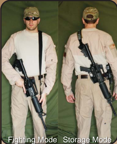
Fighting Mode Storage Mode

Under Strong Shoulder Carry Easy transition to muzzle down rear carry of the weapon.