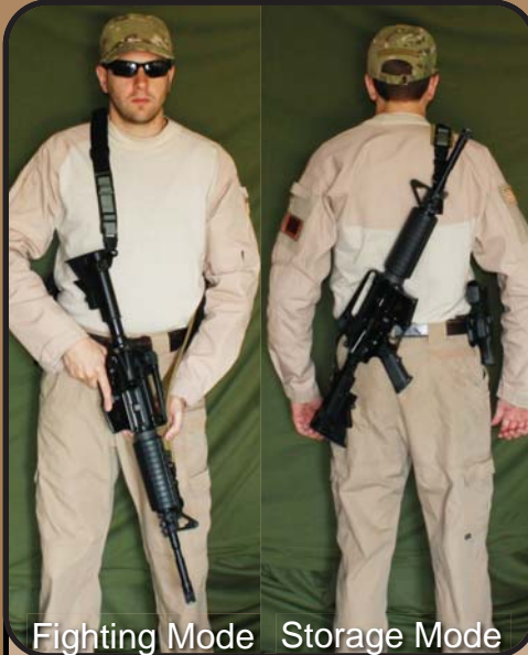
Fighting Mode Storage Mode

Under Strong Shoulder Carry Easy transition to muzzle down rear carry of the weapon.