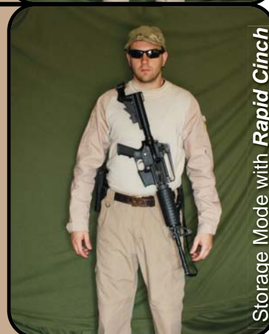
Storage Mode with Rapid Cinch

This carry style works great for fast roping or other situations where the rifle will be needed quickly.