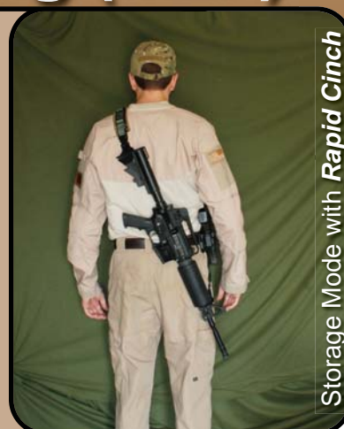
Storage Mode with Rapid Cinch

When the weapon is moved onto the Users back it is facing muzzle down and is able to be Rapid Cinched from the front, securing the weapon (as tightly as desired) to his/her back. Release Rapid Cinch by pulling upward on the Tension Lock .