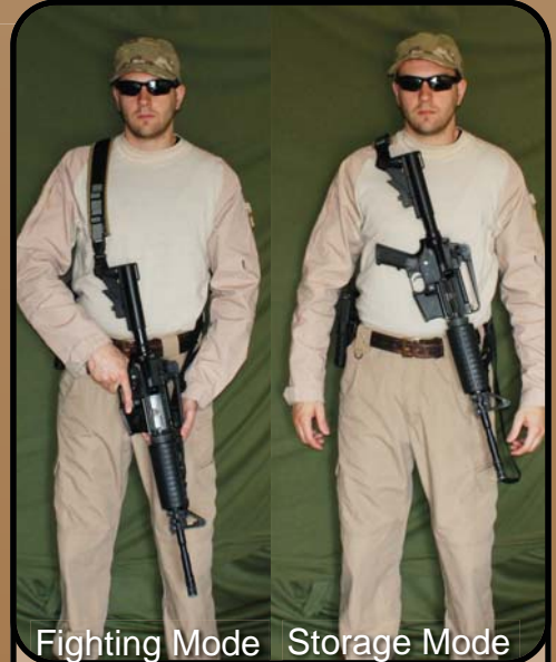
Fighting Mode Storage Mode

Over Strong Shoulder Reverse Carry Easy transition to muzzle up rear carry of the weapon.