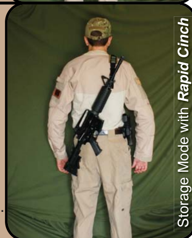
Storage Mode with Rapid Cinch

Rapid Cinch is accomplished with the same motion as Under Strong Shoulder Carry (by pulling down on the Rapid Cinch Strap which will be located on the Users front when the weapon is to the rear. Release Rapid Cinch same as above.